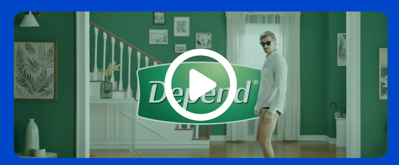
Play Depends Men's Washable TV commercial

Another way we reduced our plastic packaging footprint was by incorporating recycled content. We're pleased to share that Viva paper towel and Kleenex toilet paper packaging including the products sold through our Professional business, now include 20% recycled content, which helps save over 100 tonnes of virgin plastic each year.